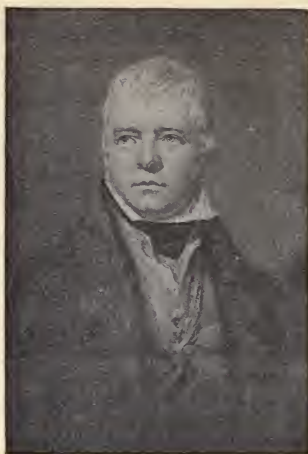
SIR WALTER SCOTT.

Now Ready. Crown 8vo, tastefully bound in Green Cloth, Gilt, in which binding any of the Novels may be bought separately, price 3s. 6d. each. Also in Special Cloth Binding, Flat Backs, Gilt Tops, supplied in Sets only of 24 Volumes, price £4 4s.